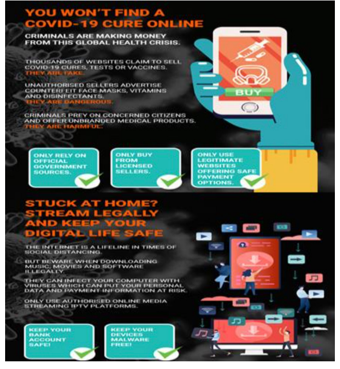
EUROPOL: Alert on COVID-19 related cyber frauds

Ethiopia declared that it is enhancing its national payment system and banking through digital means as stipulated in the recent <u>directive</u> issued by the National Bank of Ethiopia. An Ethiopian bank informally requested about new cyber-related crimes responded that there is a trend of increasing attempt of email-based scams and frauds but he cannot confirm whether it is directly related with the pandemic. Other two banks responded that they did not observe a new threat though the situation of the pandemic has created vulnerabilities. Kenyan banks are providing repeated alerts on the potential danger of frauds and scams by criminals that need further investigation. Generally, it is observed that the more internetbased services and interactions are becoming a norm the more financial services and their clients are vulnerable to infiltration and attack by criminals.