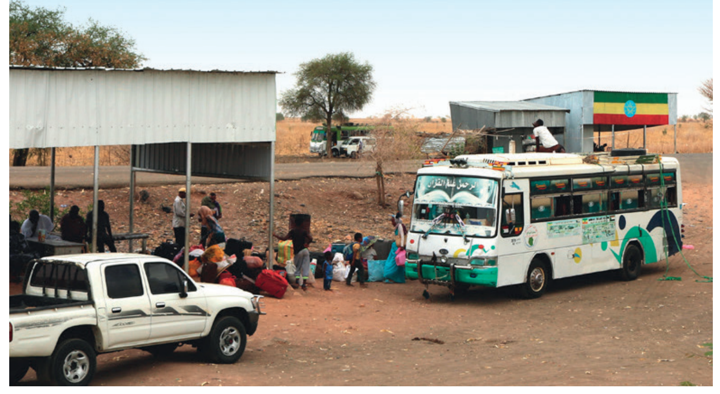
Horn of Africa: © PHOTO; POOL

national services and cou tries in the region.