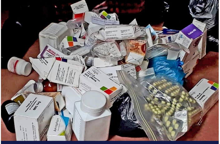
Emerging Crime Threats of COVID-19 Pandemic in the Greater Horn of Africa